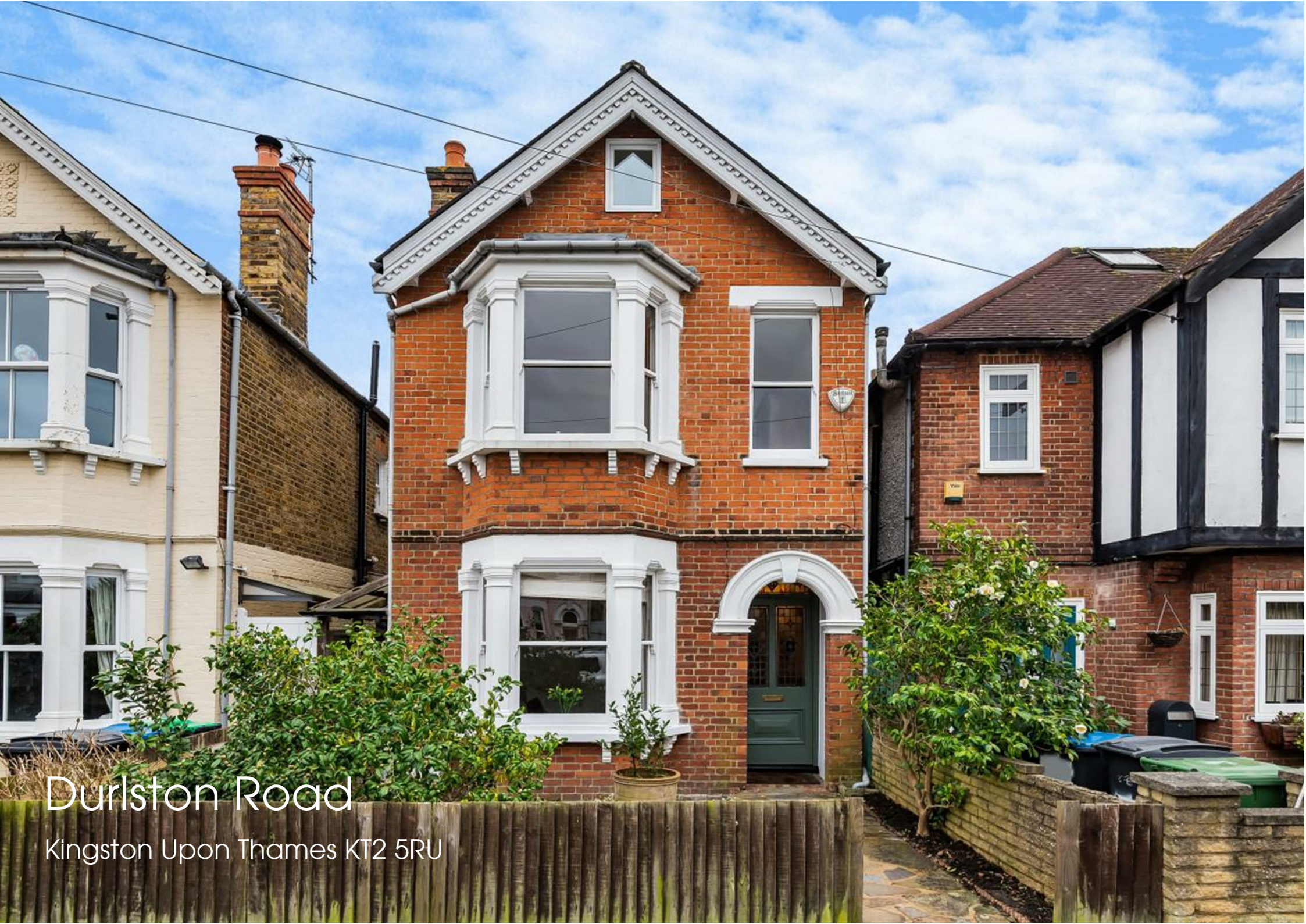
Durlston Road Kingston Upon Thames KT2 5RU